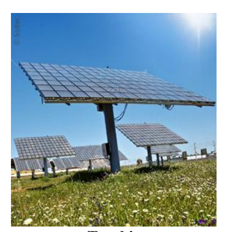
Concentrator Tracking Modules System

Reflexite will own the machinery and equipment used to produce the optical lens component for the CPV modules. All other machinery and equipment at the San Diego facility used to produce the finished CPV modules will be owned and operated by Soitec. Both the lenses and completed modules will be manufactured within the San Diego facility. All of Reflexite's output will be provided to Soitec under the joint venture agreement.