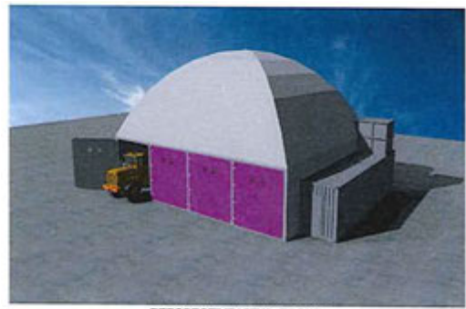
PERSPECTIVE VIEW - FRONT

The biogas will be produced by four dry anaerobic digesters. The air from the facility will be processed through an air circulation and control system that effectively contains, circulates and exhausts air as necessary through a specially designed bio-filter to control odors.