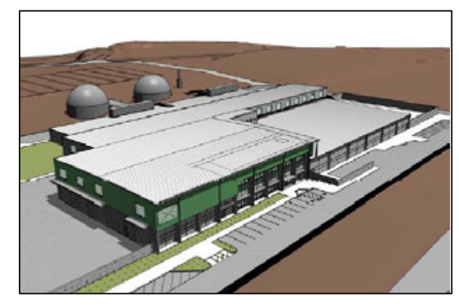
Mixing Hall and Anaerobic Digestion Tunnels