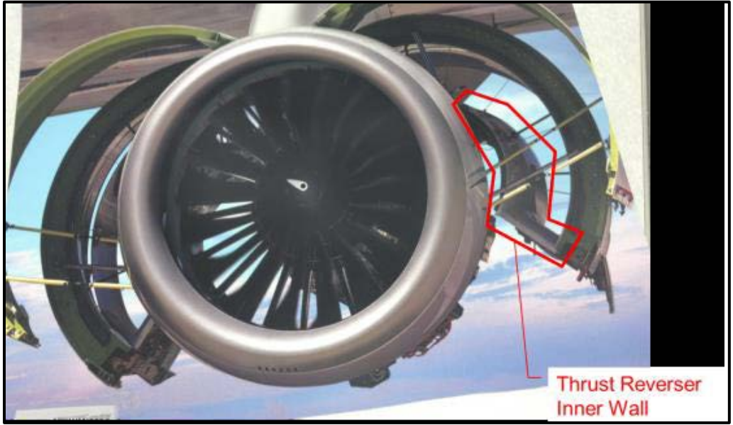
Figure 1. Titanium Inner Wall being developed for the General Electric LEAP engine.

Preparation for the TIW project has required custom tools and processes developed by GKN to produce the detailed parts needed for final assembly.