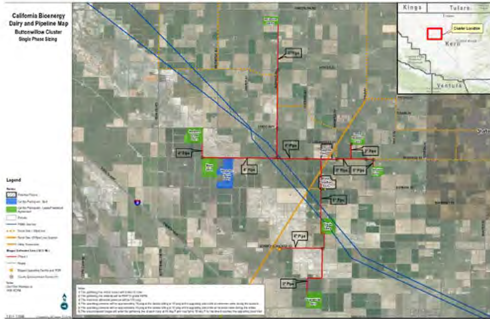
Figure 1: CalBioGas Buttonwillow Dairy Digester Cluster Map