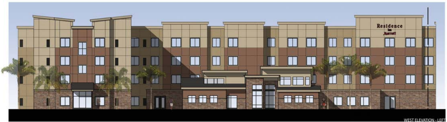
Redondo Beach Hotel

The Redondo Beach Hotel received $45M by the Committee to build two hotels, a Residence Inn and a Hilton Gardens Inn on the campus of Redondo Beach. The combined jobs created will provide 107 permanent jobs with salary ranges from $30,000