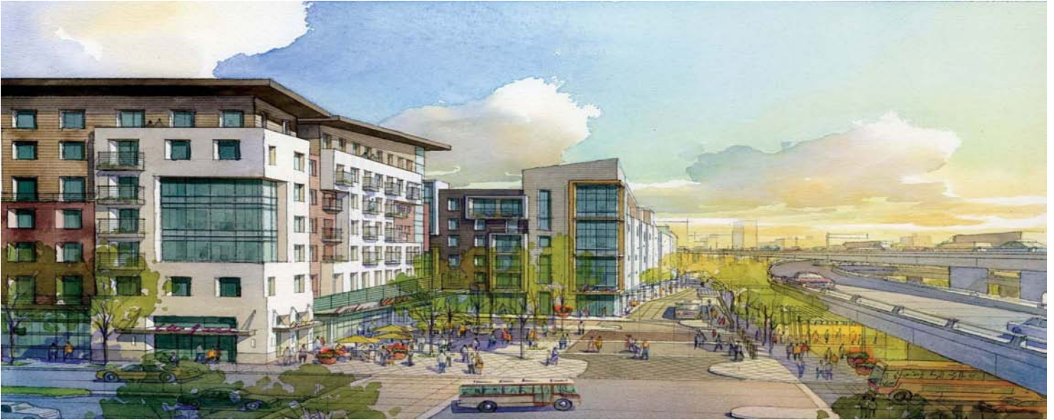
MacArthur Frontage Road View