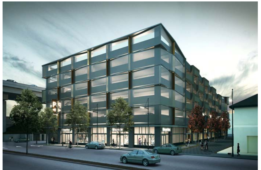
MacArthur Evening View

The MacArthur Transit Village Project received $3M by the Committee to replace the existing surface parking lot at the MacArthur BART station in Oakland with a 450-space structured garage in order to accommodate the development of 624 residential units and 42,500 square feet of commercial space on the site. The project was awarded $37M in State Proposition 1C funds in 2008 to assist with the construction of the BART garage and the project infrastructure. The parking garage will consist of 156,000 square feet. The Station currently has an average daily ridership of about 6,700 patrons.