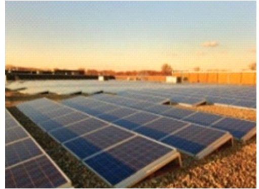
Sun Edison solar panels.

Sun Edison, LLC was awarded a total of $9,994,269 by the Committee for the Irvine Unified School District Solar Project. The project involves the leasing and installation of rooftop solar panels. The project will provide electricity priced below current utility prices for the amount of electricity the panels produce. The panels are manufactured by Sun Edison's parent company, MEMC in Pasadena, CA.