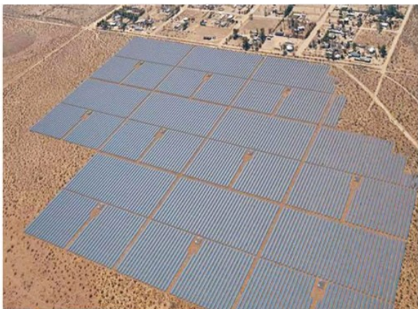
Pine Tree Solar Facility

Pine Tree Solar Project was awarded $48M by the Committee. The Department of Water and Power of the City of Los Angeles (LADWP) will build and operate a 10 MW solar photovoltaic electrical generation facility. It will produce