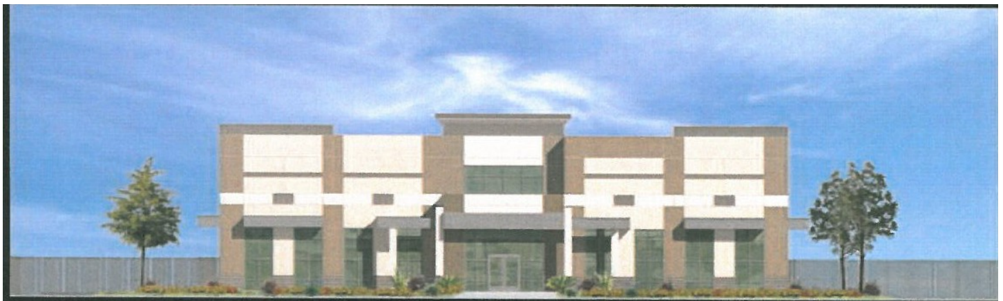
Above and below: City of El Monte Public Works Project