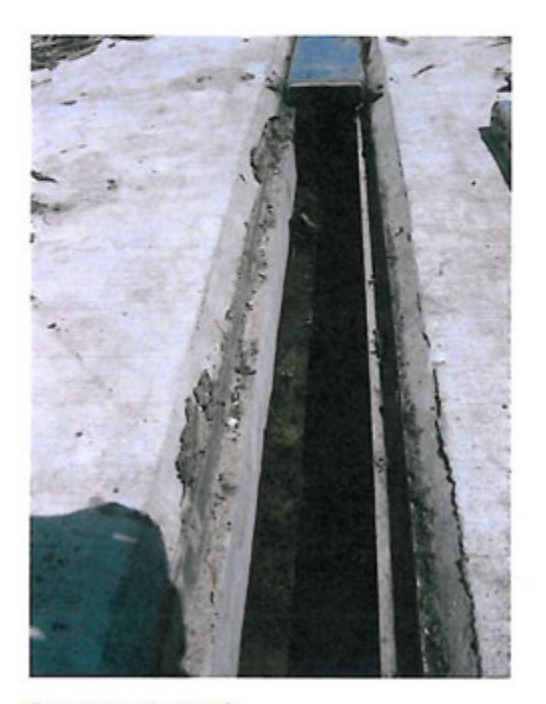
Figure 1: Aeration Trench