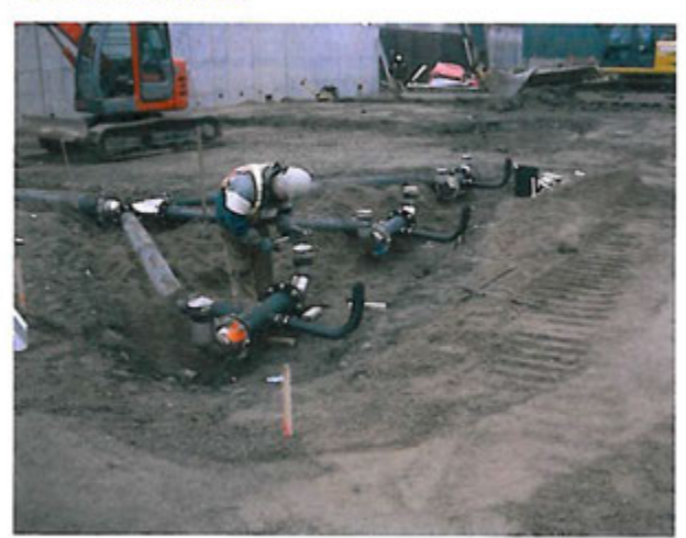
Figure 3: Aeration Floor Piping (B/G)