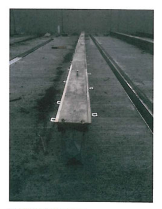
Figure 2: Aeration Trench Form