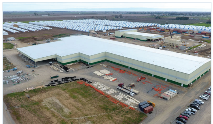
When construction is complete, CalPlant I will be the world’s first commercial-scale producer of rice-straw-based medium density fiberboard.

An interactive online tool developed by the State Treasurer’s Office called DebtWatch is available on the Treasurer’s website and allows anyone to explore bonded debt at a local government level up through and including state indebtedness.