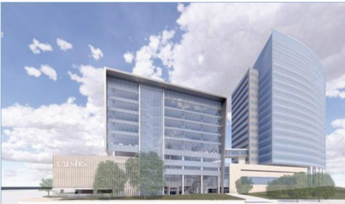
Artist's rendering of the planned expansion of the West Sacramento headquarters of CalSTRS, a project funded through green bonds sold through the Public Finance Division.