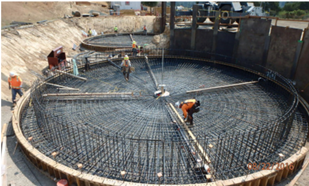
San Jose Water Company project under construction.

CPCFA's water furnishing conduit issuances, such as the 2016 San Jose Water Company tax-exempt private activity notes worth $70,000,000, allow private water providers to prevent the pollution and contamination of drinking water and improve the quality of water. San Jose Water Company made upgrades to its treatment plants, wells, reservoirs, tanks, pump stations and other functionally related structures and equipment throughout their service area in various portions of incorporated and unincorporated Santa Clara County.