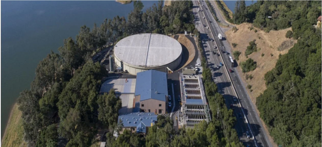
San Jose Water Company completed project.

In addition to the issuance of tax-exempt private activity bonds/notes and taxable bond anticipation notes, CPCFA is tasked with coordinating the review of certain rate reduction bonds to finance and/or refinance certain water, wastewater and electrical utility projects approved by joint powers authorities. Rate reduction issuances are designed to allow California local agencies that own and operate utilities to access financial structures to lower the cost of financing projects, including water projects integral to reliably delivering drinking water to Californians.