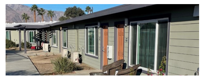
Cathedral Palms Senior Apartments, Cathedral City, California.