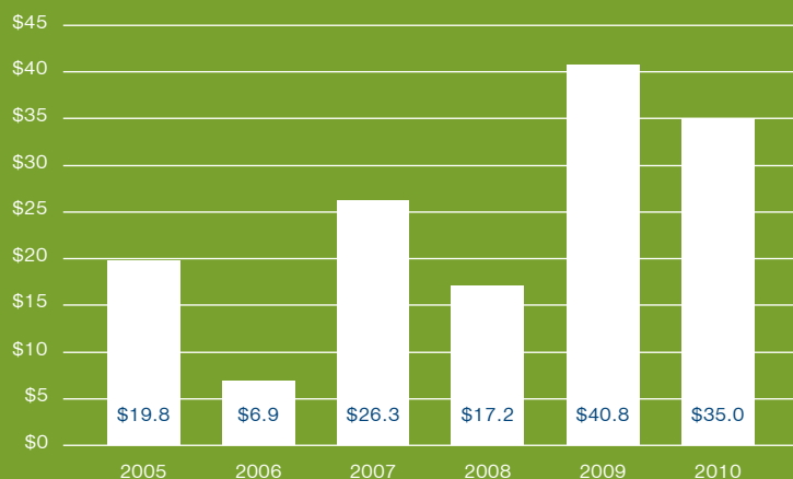
2010 BUILD AMERICA BOND ISSUANCE